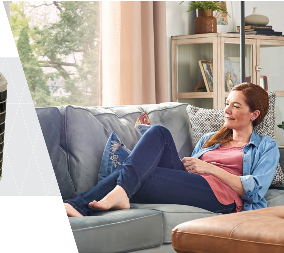
Models 284A, 288B